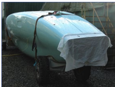
Anticlockwise from left: laminating the first hull for the sailaway; hull joining; and release; the start of the first hull for the kit boat